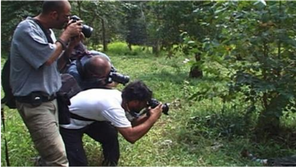
Renzo Martens "Untitled (fragment of -Episode 3)", 2008